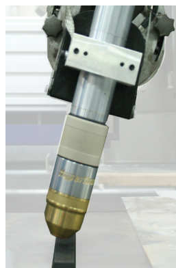
Manual Plasma Stripping Bevel Unit featured in the X-Axis. Photo shows a straight line bevel cut piece at 22 1/2°.

Available on EdgeMax, PlateMaster II, MetalMaster Evolution, MetalMaster Xcel, Titan III, MPC2000, and TMC4500 DB.